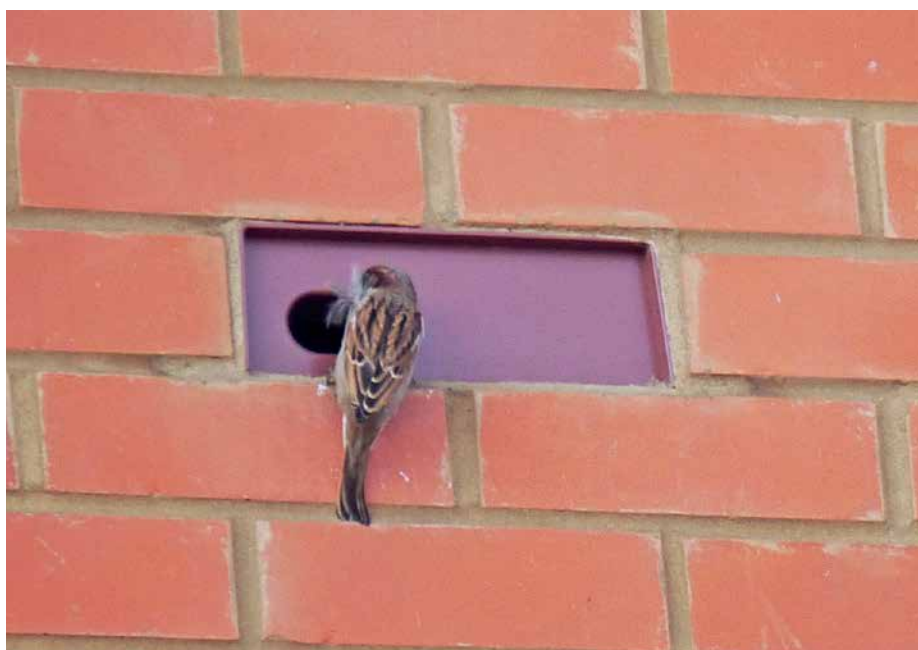
Figure 4. House sparrows also use swift nest bricks and can attract swifts to nest.

House sparrows and tits will happily use swift bricks (Figure 4) as well as sparrow bricks or external sparrow terraces, which swifts cannot use. Sparrows and tits will not generally exclude swifts from a nest