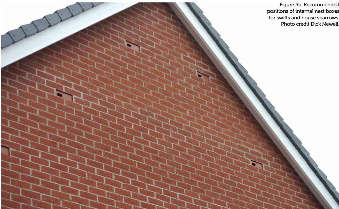
Figure 5b. Recommended positions of internal nest boxes for swifts and house sparrows.

Apple and Android phones. It has the same objectives as the RSPB survey but with the added flexibility of recording sightings in the field. Records from the app may be exported into other systems such as the RSPB Swift Survey.