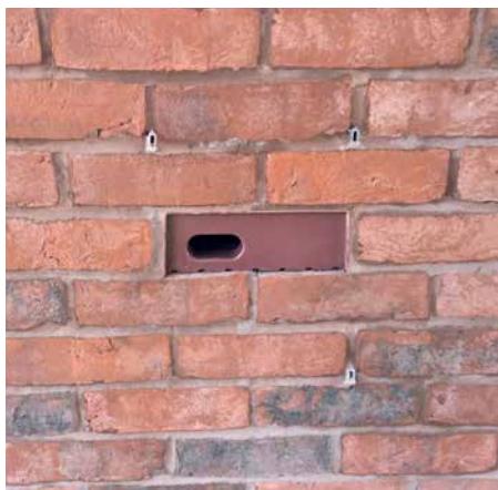
Figure 2. An example of a Manthorpe brick.