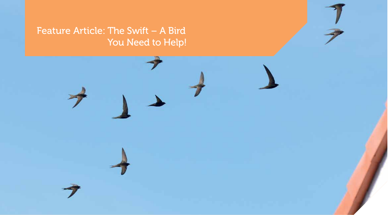
Figure 1. Swifts are a familiar sight above the rooftops of our villages, towns and cities.